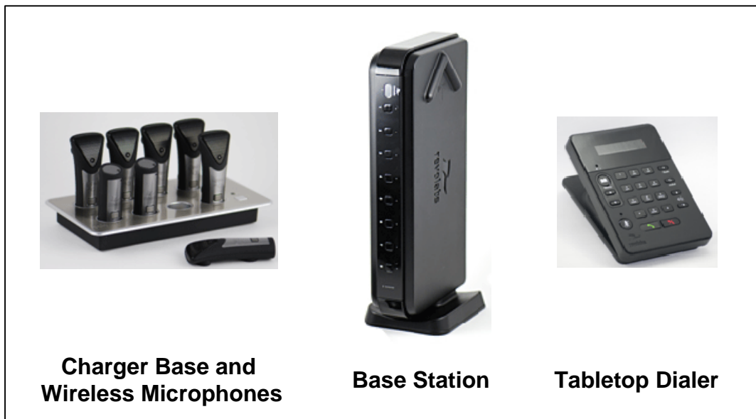
Figure 1: Revolabs Fusion System

The Revolabs Fusion system includes the following components; the Base Station, the Charger Base, the IR Remote Control, 4 or 8 Revolabs Wireless Microphones, and an optional Tabletop Dialer.