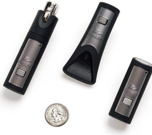
Figure 3: Revolabs Wireless Microphones

Revolabs Wireless Microphones – Available in four types (wearable, omni-directional tabletop, uni-directional tabletop, and as an attachment to an existing XLR microphone), the wireless microphones provide up to eight hours of talk time on a single charge. Each microphone has a single button used for pairing (or marrying) the mic to the base station during system setup (may not be necessary if the mics were purchased together with the base station) or for toggling the mute status. An LED on each microphone displays the pairing, mute, and power / charging status of the device at all times.