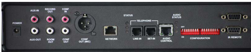
Figure 2: Fusion Base Station (Rear View)

The Fusion Base Station - The center-piece of the Fusion system, the Base Station receives the wireless, encrypted audio signal from each of the system microphones, decrypts and processes the audio as appropriate, and hands off the audio signals to the videoconferencing system or integrated AV system. The unit can be mounted horizontally or vertically (using the included vertical stand), and LED indicators on the front of the device display power, audio level, and microphone mute status information. The rear of the unit provides numerous audio out connections (RCA, XLR, etc.), telephone in/out connections, and two banks of dip switches used to adjust the operation of the system (transmission power, wireless frequencies used, etc.) if necessary.